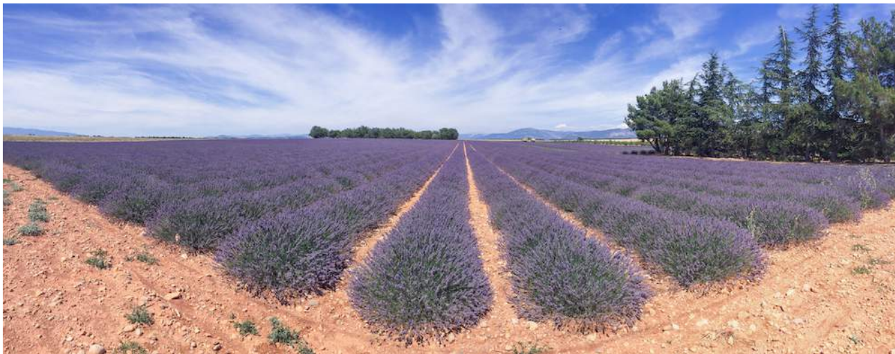
Ultra was in France in July inspecting the conditions of Lavandin Grosso. You can see more pictures on our Facebook page!