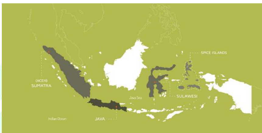
Wild and plantation areas of Indonesia – Aceh, Java, Sulawesi & Spice Isl.

Plantations began in Indonesia after a run of poor crops from the Aceh region about seven years ago. Old trees had been attacked by worms, resulting in short-term crop losses. As a result, prices began to rise on the back of limited supply, finally peaking in late 2013 and early 2014. Many saw the opportunity to start new plantations on other islands, in part because nutmeg trees require only a limited investment.