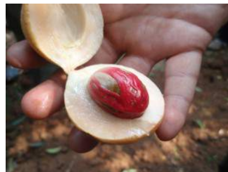
Fresh nutmeg fruit covered in mace

The nutmeg tree, Myristica fragrans , is indigenous to the Maluku Islands in Indonesia. For those unfamiliar, the fruit contains a nut, which is covered by a hard shell. A red-colored webbing (known as mace) covers the shell. Once ripe, the fruit will open, revealing the mace, which will fall to the ground to be collected, or it can be picked just before falling. The mace will then be carefully removed, leaving the nutmeg (nut) available to be ground and processed. The mace is also further processed as oil or sold as a ground spice after being graded.