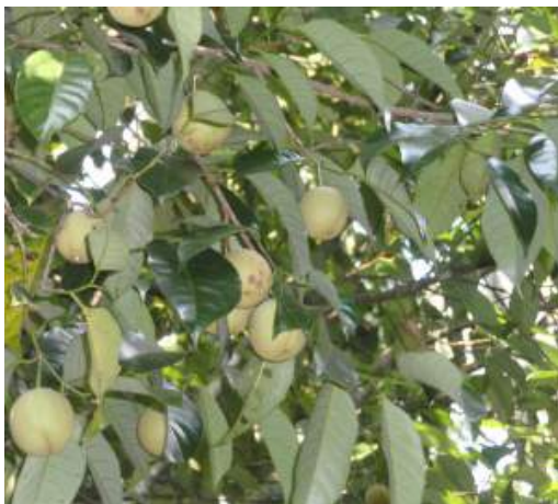
Ripe nutmeg fruits ready for harvesting

profitable business for farmers? Will investments in new plantations continue with lower market price expectations? The dynamics are seemingly complicated and could go either way.